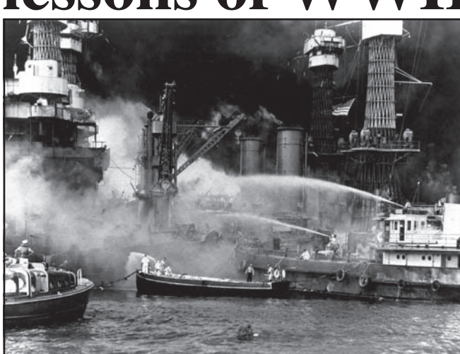
A fireboat pours water onto the burning battleship USS West Virginia BB-48 following the attack by Japanese naval aircraft Dec. 7, 1941. The USS Tennessee is in the background.

the sky, engaging in a one hour and 15-minute attack that led to